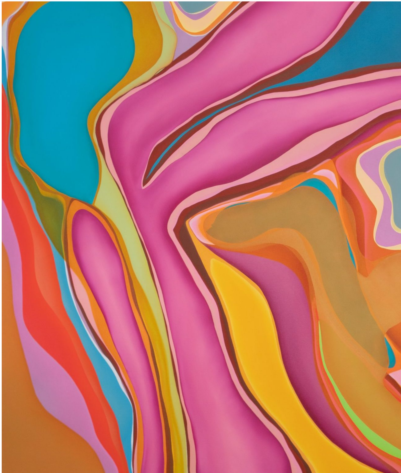
Bethany Czarnecki, Flourish II, 2021. Courtesy Massey Klein Gallery